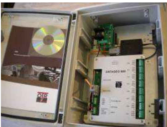
Datalogger D800 (Code OD800C008)