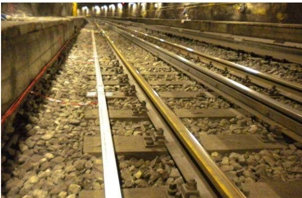
MyOtr – Railway deformation monitoring system